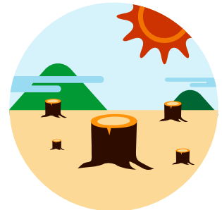
Cutting down trees