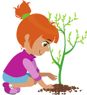
Planting a tree