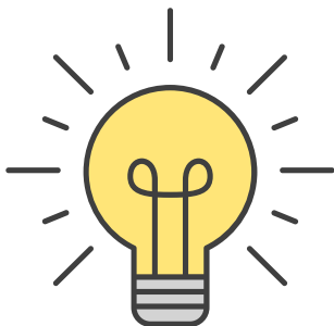
Leaving lights on