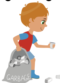
Picking up garbage