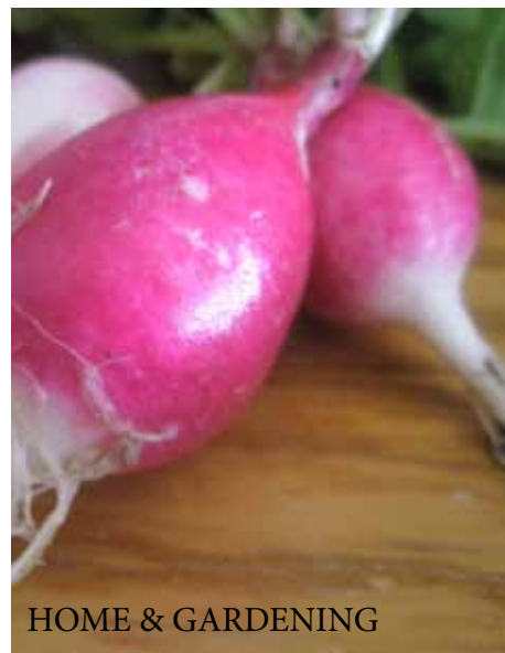
HOME & GARDENING